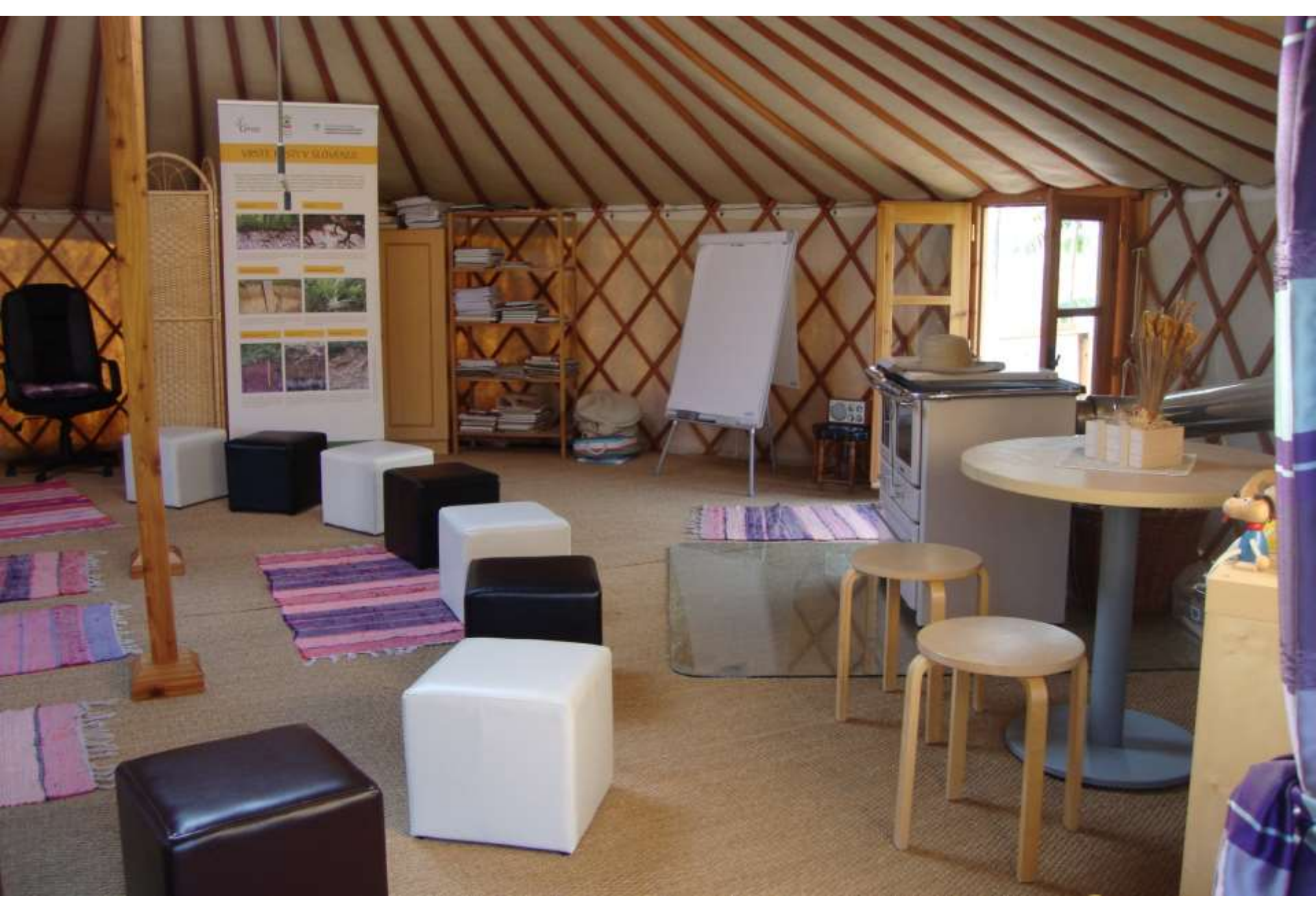
Classroom in the nature in yurt